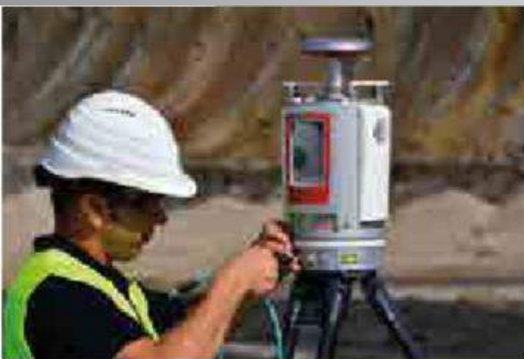
RIEGL VZ-2000i in the field