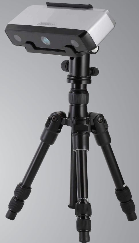
EinScan Discovery Pack